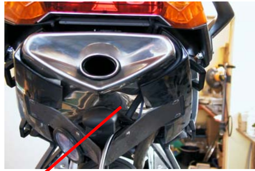
Route tubing as shown. We supply a piece of viton tubing, to protect our Scottolier tubing around the exhaust pipe. It's selected for its high temperature and oil/petrol resistance.