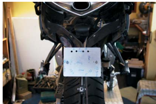
Backing plate is available free of charge from Scottolier.