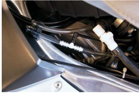
Vacuum connection with tee piece in place, and damper elbow.